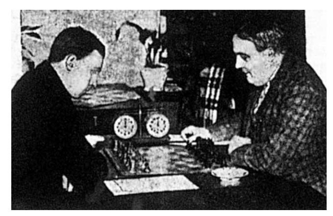
The match opponents, ready for the first game.

Play began in Allécaféet at 5.30 pm on April 4. While the audience sat down in the actual café, following the games on a demonstration board, the players had a quiet place in Majorna's room. The match unmercifully revealed that Ståhlberg wasn't yet ready for the international arena. His opening repertoire didn't meet the modern requirements and gave Bogoljubow two easy victories to begin with. Ståhlberg learned